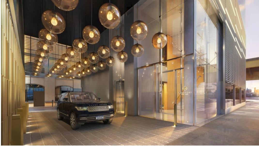
Porte cochère at 1 Seaport.