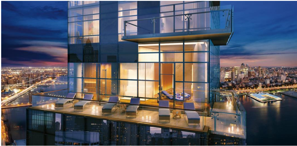
Sky lounge at 1 Seaport.

Additionally, there will be a porte cochère, a children's playroom, bike storage, a lounge in the lobby, private storage units, and a sky terrace. Fortis Property Group is the developer, while Goldstein, Hill & West Architects is the design architect. Groves & Co. is the interior designer. Foundation work recently completed, and verticality is expected over the next few weeks.